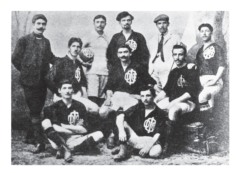
The football team of Salonica at the Intercalated Olympic Games in 1906 \,

At the Games, the Salonica team was joined by the team of the Copenhagen Football Association, which was representing Denmark; the team of Ethnikos Syllogos , joined by one player from the Panellinios , representing Athens; and finally, the team of Ottoman Smyrna, consisting of the sons of English, French, and Armenian merchants from the port city. <sup>67</sup>