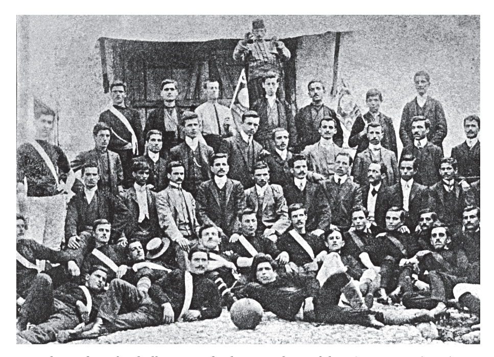
The Vodena football team and other members of the Elpis society (1909)

lation was predominantly Slavic, but preferred the Greek Ecumenical Patriarchate to the Bulgarian Exarchate; there was also a strong Turkish minority. Still, the emergence of football in the city is mainly attributed to the proximity of Naoussa and Salonica. There is no specific mention of a football match played in Vodena; however, a 1909 photograph showing members of the Elpis (" Hope ") sports association, established a year earlier, confirms the presence of a football team in the city.<sup>122</sup>