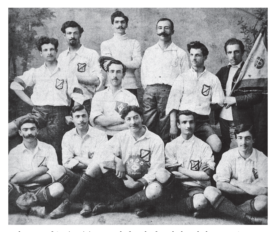
The team of Omilos Philomouson before the first clash with the Union Sportive