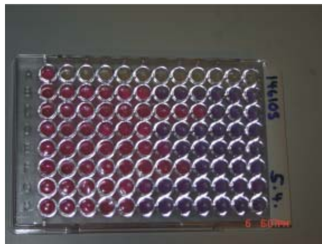
Figure 2: SYO5 Sensititre panels.

Pharmaceutica), voriconazole (VZ) (Pfizer). Stock solutions of the antifungal agents were prepared in 100% dimethyl sulfoxide and diluted 100 times to their final concentration, further diluted in RPMI 1640 medium, for all antifungal agents (except for amphotericin B, for which AM3 was used), buffered to pH 7.0 with MOPS buffer, and dispensed into 96-well microdilution trays (Fig. 1). The final concentration of the antifungal agents in the wells ranged from 0.06 to 16 µg/ml (amphotericin