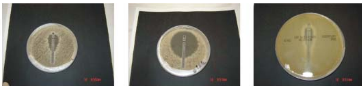
Figure 3: E-test gradient strips of different antifungal agents.

SYO5 panels (Trek Diagnostic System, UK) with incorporated Alamar blue containing twofold serial dilutions of dried antifungal drugs were used (Fig. 2). The concentration range for each agent is as follows (Amphotericin B = 0.008-16 µg/ml; Fluconazole = 0.125-256 µg/ml; Itraconazole = 0.008-16 µg/ml; Ketoconazole = 0.008-16 µg/ml; Flucytosine = 0.03-64 µg/ml;