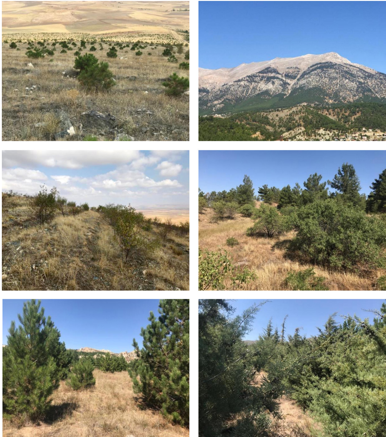
Figure 2. Photographs of afforestation examples in Inner Anatolia

Success in Anatolian black pine afforestation. Correlations between morphological attributes and field performance in P. n. subsp. nigra var. nigra were stronger for the plot with shallower soil, having potentially drier conditions. Morphological features better forecasted field performance in the first three years at the shallow soil site, with the number of the first order lateral roots being