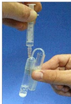
Fig. 4. Assembled apparatus held in hands