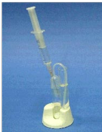
Fig. 3. Assembled apparatus placed on a stand