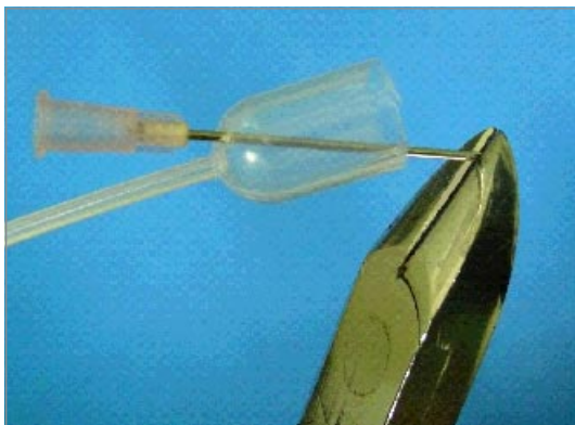
Fig. 2. Cutting needle's tip

The microscale gas generation apparatus assembling starts by inserting the calcium carbonate in a test tube using small spoon. Pipette bulb is half cut with scissors and than is pierced through with a syringe needle as shown on Fig. 2.