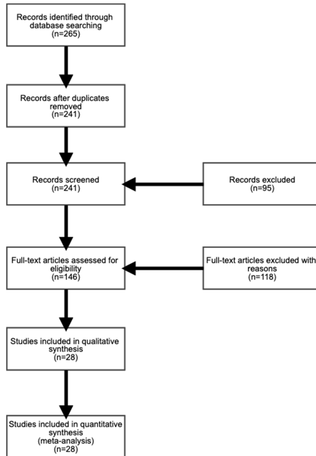
Figure 2. Flow diagram of identification and inclusion of papers.

As illustrated in Figure 2, our review identified 265 papers that included twenty-four duplicates, which were removed. The remaining 241 works were evaluated in terms of title, abstract, and keywords, resulting in the exclusion of 95 citations. The main criterion for the exclusion of papers was because 95 articles were not related to the applicability of mobile sensors available in an off-the-shelf mobile device. We performed the full-text evaluation of the remaining 146 papers, excluding 118 articles that did not match the defined inclusion criteria. The remaining 28 papers were included in the qualitative synthesis and quantitative synthesis. In summary, our review examined 28 documents.