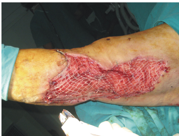
Figure 1: Defect closure of crural region with skin graft (mesh graft).

This is a retrospective – prospective analytic study. It involves 1512 patients treated on our Clinic in six-year period (2001 -2007), due to any reason that indicated utilization of defect closure techniques. Inclusion criteria were soft tissue defects of any reason that could not be directly closed. Patients with defects that were directly closed and patients with defects that were left to heal by second intention were excluded from the study. Each patient was followed-up within 6 months after surgery. Patients were divided in two major groups depending on clinical per operative findings: first group which included 774 patients where skin grafting was used and second group which included 738 patients treated