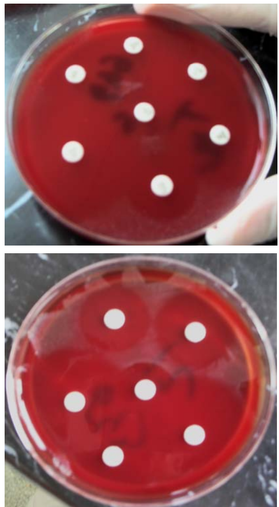
Figure 4: Susceptibility testing on Columbia agar.

and were also oxidase positive with the paper strip (Oxoid, UK) method. Antibiotic susceptibility testing was performed on Mueller-Hinton agar and very poor growth was observed. Another susceptibility testing was performed on Columbia agar (Oxoid, UK) and the growth of greyish colonies was observed. The bacterium was susceptible to all tested antimicrobial agents (beta-lactams: amoxicillin-clavulanate, piperacillin-tazobactam, imipenem, meropenem, cefuroxime, ceftriaxone, cefotaxime, ceftazidime, cefixime, cefepime; aminoglycosides: gentamicin, amikacin; quinolones: ciprofloxacin and co-trimoxazole) (Figure 4). After 48 and 72 hours anaerobic cultures was checked if the growth of some anaerobic organisms appear. Sabouraud medium was also observed after 3 days of incubation. Neither anaerobic bacteria nor yeasts were present in both media. On anaerobic cultures only the identical colonies as on Columbia agar had grown.