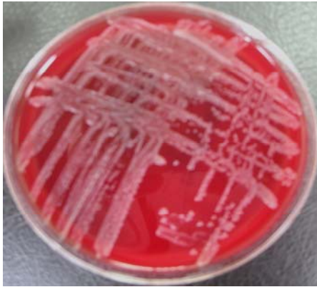
Figure 2: Culture on Columbia agar.

The collected specimen was used for Gram stain and culture. A direct gram-stained smear from wound specimens was performed at the time of culturing, and only 5-10 leukocytes per field were observed. No bacteria were detected. Gram stain didn't correlate with culture results. Both aerobic (Columbia agar) and anaerobic cultures (Schaedler