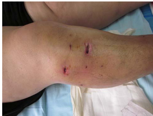
Figure 1: Wound presentation 4 days after dog-bite.

The next control (after 4 days) showed even greater progress (Figure 1).