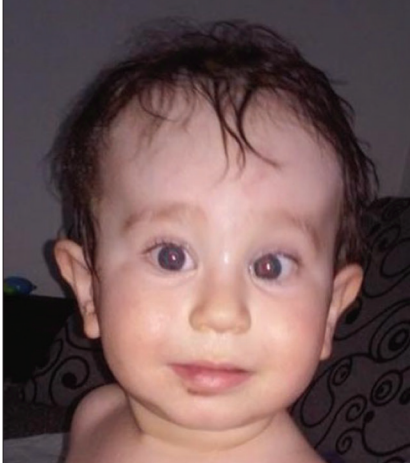
Figure 5b. The same patient five months after surgery

The trigonocephaly (premature fusion of the metopic suture) takes 4% of all simple non-syndromic craniosynostoses.<sup>6</sup> The clinical appearance is typical, with wedge-shape, triangular forehead, flattened supraorbital rims, thickened metopic suture and cranial index with normal value. The computed tomography of the brain is also typical, with flattened bilateral frontal lobes and small anterior cranial fossa. The only treatment for trigonocephaly is the surgical