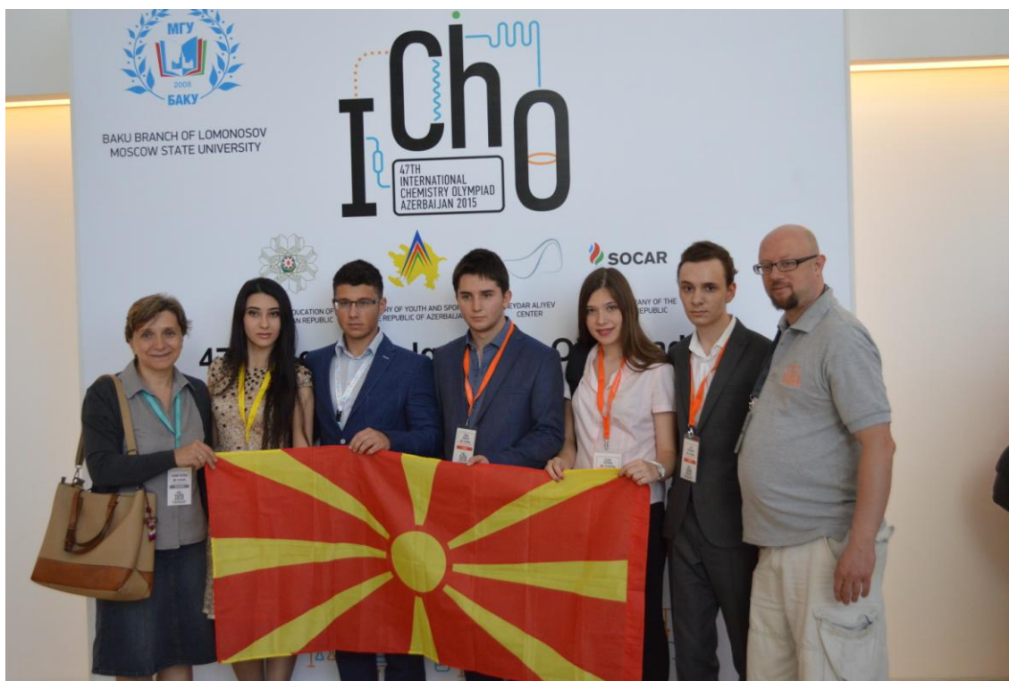
The Macedonian team at IChO 2015